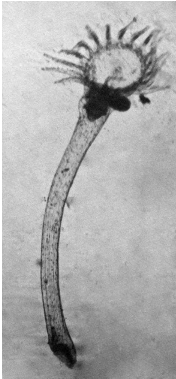
FIGURE 3. Photograph of a live individual of Loxosomella cubana n. sp.