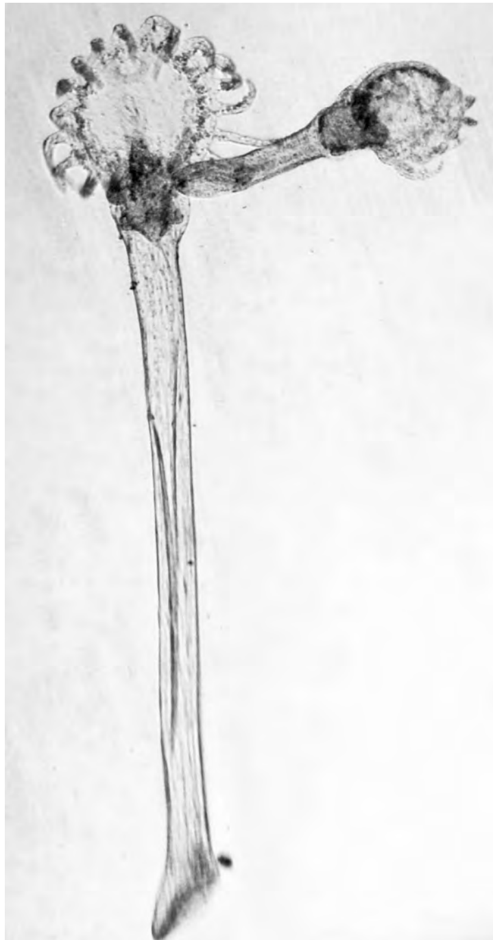
FIGURE 2. Photograph of a live individual of Loxosomella cubana n. sp. with a large bud.

Regarding their geographical distribution, L. bocki is known from the Gilbert Islands (Pacific Ocean) (Franzén 1966), L. plakorticola from Western coast of Okinawa Island (Pacific Ocean) (Iseto et al. 2008), L. cochlear from the Mediterranean Sea (Nielsen 2008), and L. museriensis from the Red Sea (Bobin 1968). Only L. vivipara has been collected relatively close to L. cubana n. sp. , particularly in Saba Bank (Netherlands Antilles, Caribbean Sea) and Florida waters (Emschermann 2011).